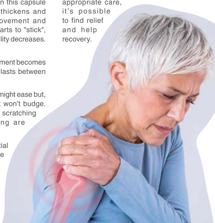
Approximately 3-5% of Australians develop frozen shoulder during their lives, and up to 1 in 5 diabetics are affected.

With the right approach, dedication and appropriate care, it's possible to find relief and help recovery.